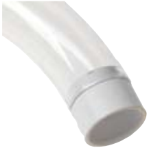
Interchangeable Tip Guard and Tracheal Suction Catheter Tip