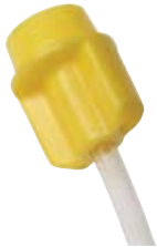
Tracheal Suction Catheter Tip