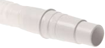
Universal Tubing Adapter

High Volume, Large Bore Oropharyngeal Suction System